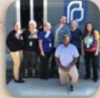
PPGNY Telehealth Team